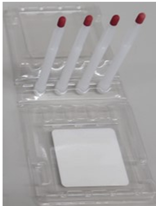
Figure 1 VAMS devices for the collection dried blood spots generated from 30 \mu L of capillary blood. VAMS, volumetric absorptive microsampling.

Prior to the workshop, meetings were held with the group facilitator (SA) to plan the session as part of a regular GenR YPAG meeting and to support the purpose of the activity including expected outputs. The dissemination of a sample of the pack were also arranged. It was decided to send packs to a small group of members who would demonstrate to the rest of the group during the meeting. In total six mock sampling packs were sent to YPAG members to facilitate a live demonstration. In the mock sampling pack, volumetric absorptive microsampling (VAMS, Neoteryx, California, USA) devices were provided with two aliquots of food colouring to mimic blood and urine. Two aliquots of water were also provided to allow a demonstration of how to recover the dried simulated biofluids.